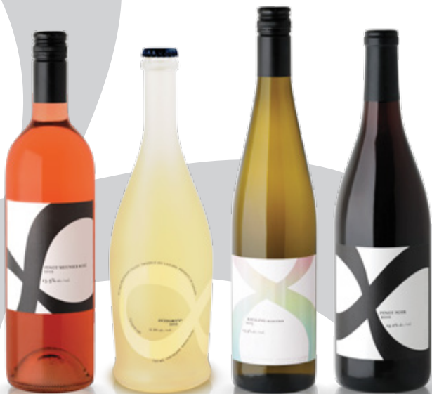
Pinot Meunier Rosé, Integrity, Riesling Selection & Pinot Noir

We welcome you to see what 230 years of winemaking experience can create.